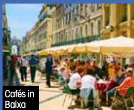
Cafés in Baixa

Head to downtown Baixa where you'll find beautiful architecture as well as rows of