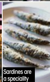
Sardines are a speciality

shops and cafés, including hidden boutiques and well-known high street shops and department stores. If you still haven't quenched your thirst for shopping, Centro Vasco da Gama is retail heaven!