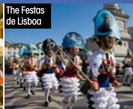
The Festas de Lisboa