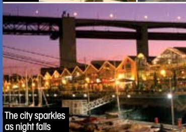
The city sparkles as night falls